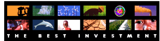
FIRST GLOBAL TEENAGER CURRICULUM