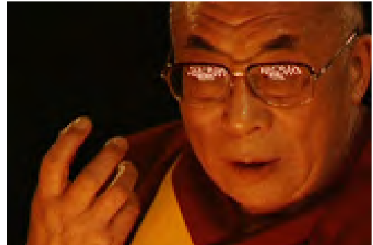
THE DALAI LAMA ON SOCIALLY RESPONSIBLE INVESTMENT, RE-DEFINING SECURITY, AND INTELLECTUAL PLURALISM GLOBAL DEMOCRACY