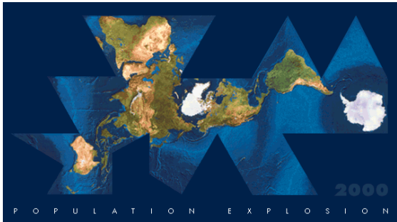
POPULATION EXPLOSION ELECTRONIC SCULPTURE