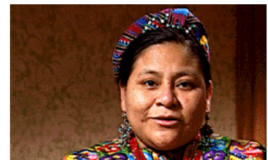
A PLEA FOR GLOBAL EDUCATION BY NOBEL PEACE LAUREATE RIGOBERTA MENCHU TUM