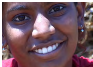
TV DOC: BE THE CHANGE!