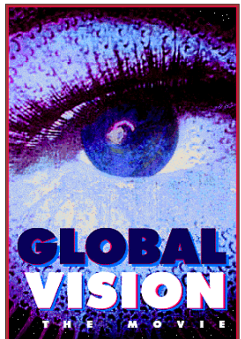
BIG MOVIE: A COLLECTIVE SELF-PORTRAIT OF HUMANKIND AND THE BIOSPHERE