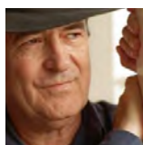
BERNARDO BERTOLUCCI ON H 2 O

I want to forge in the smithy of my soul the uncreated conscience of my race. — James Joyce