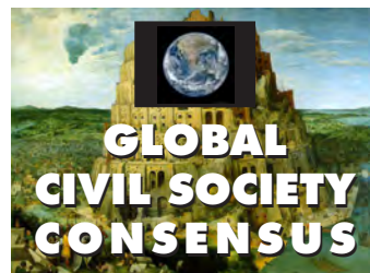
RIO+10 DOCUMENTARY: EMERGING GLOBAL CIVIL SOCIETY CONSENSUS