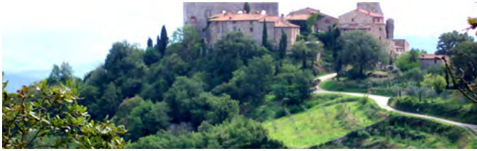
WORLDVIEW TRANSFORMATION CENTRE @ CASTLE IN TUSCANY

"The new age of education is programmed for discovery rather than instruction. Art as radar environment, radar feedback, early warning system: the antennae of the race" —Marshall McLuhan